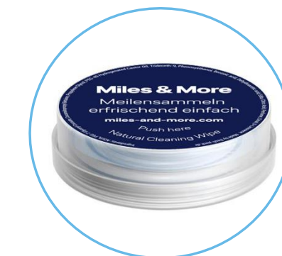
Miles & More